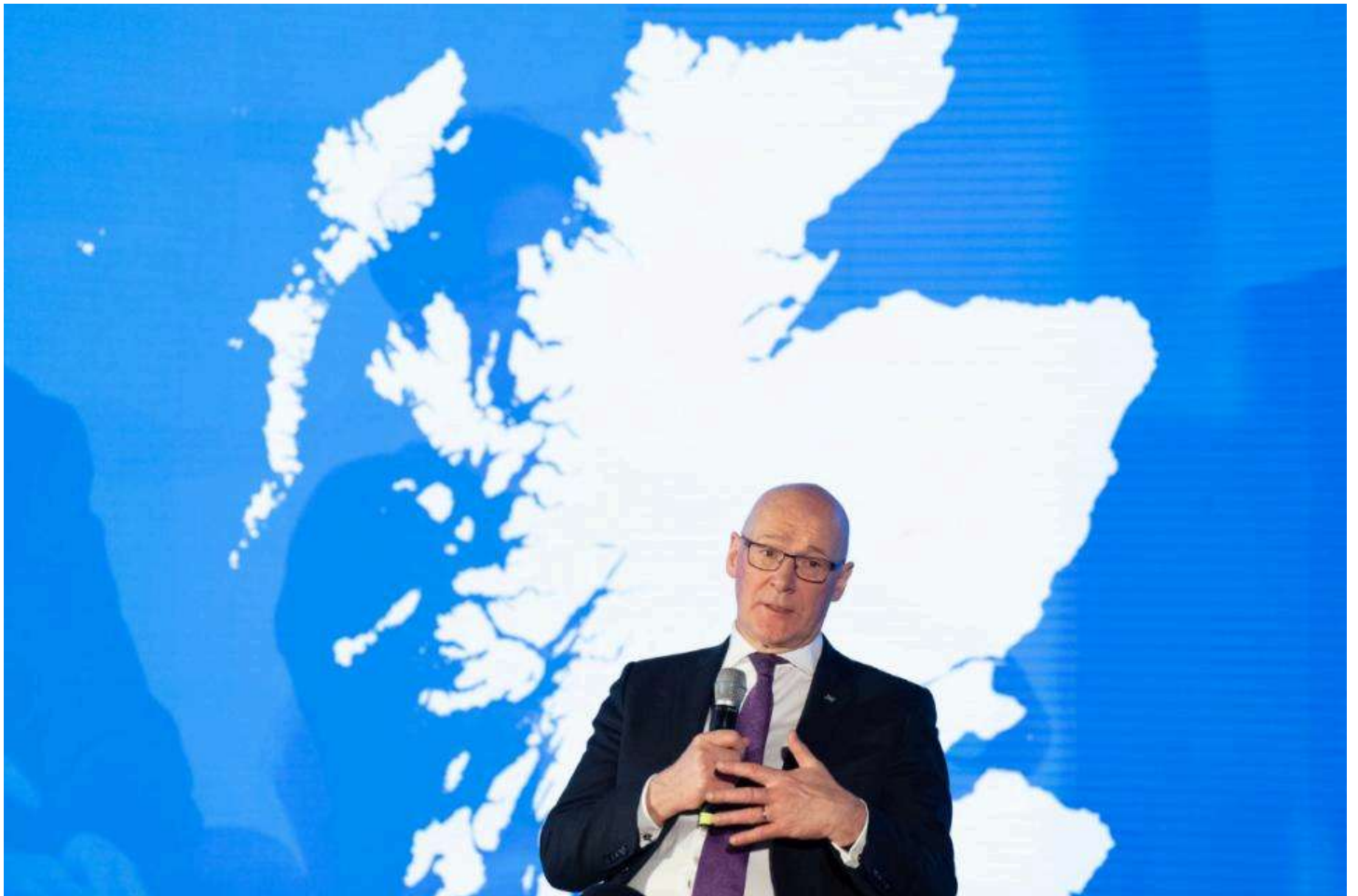
First Minister John Swinney speaking at the opening of the Techscaler hub at Water's Edge, Dundee, on March 5

16 HRS AGO NUCLEAR SCOTTISH GOVERNMENT UK GOVERNMENT NATIONAL GOVERNMENT POLITICS SCOTLAND