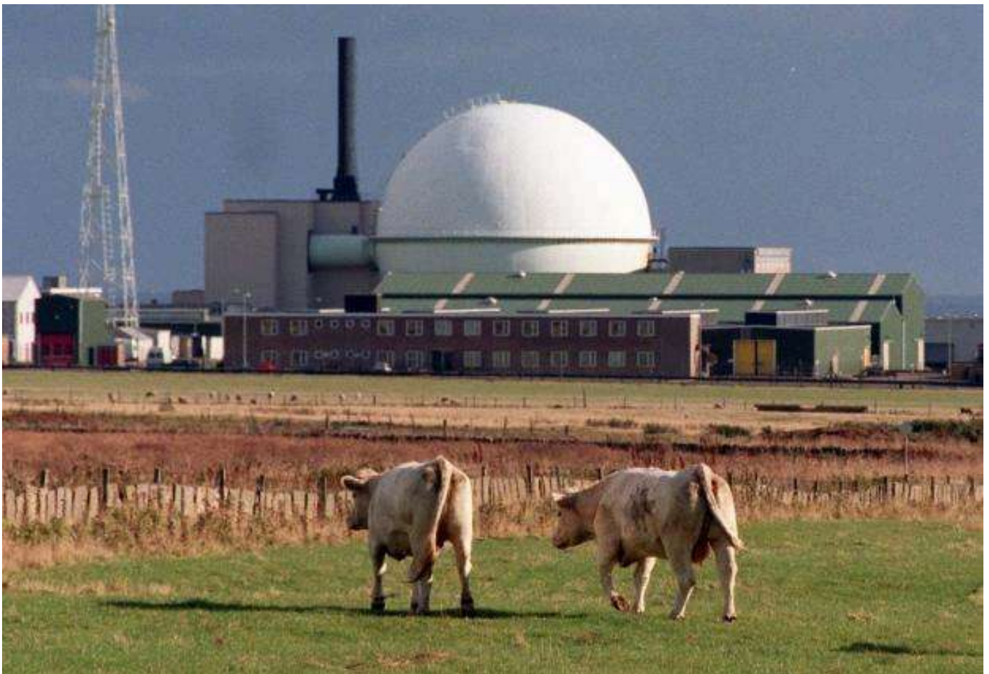
File photograph from 1996 of Aea Nuclear Reprocessing Plant at Dounreay

“There was this fantastic uprising that stopped the mining there. Orkney has become a sort of renewable energy Mecca,” she said. “It’s a good template.