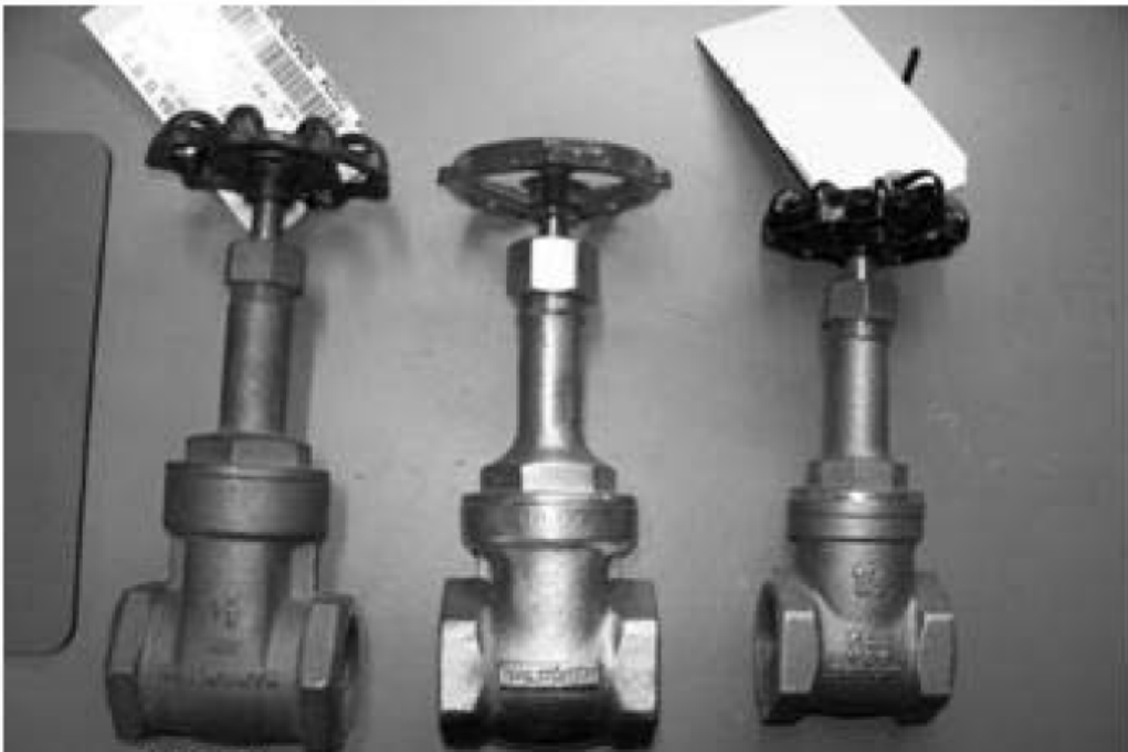
Figure 1: Example of authentic versus counterfeit components

An example of a counterfeit Walworth gate valve (center) is much like the other two authentic valves, but did not meet product specifications.